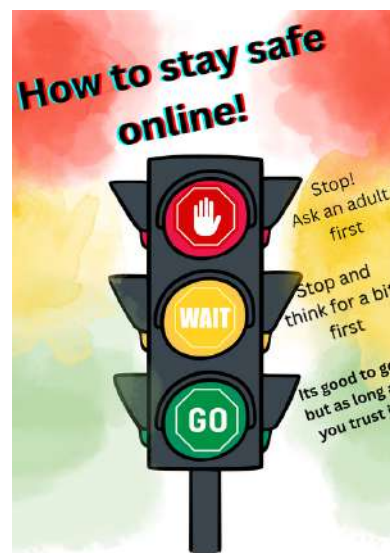
Ashley - Kāhu 1