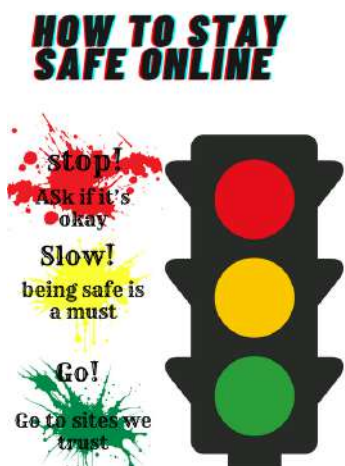
Sureiya-Cruz - Kāhu 2