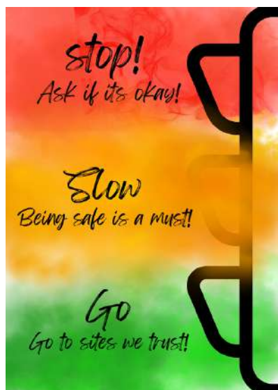
Kelsey - Kāhu 2