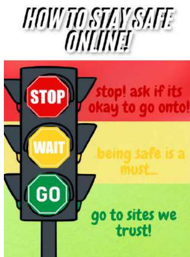
Tsariah - Kāhu 3