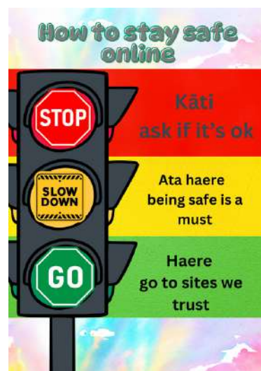
Aurelia - TWK 6