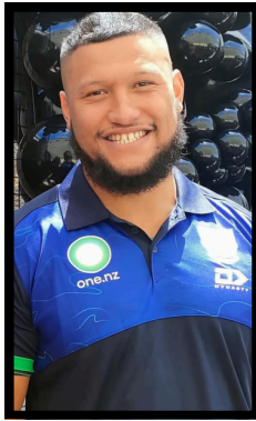
Matua Mauri Te Whakatipu Kākano 5

We would also like to welcome 3 new kaiako at Rānui School.